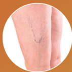
Varicose veins and spider veins